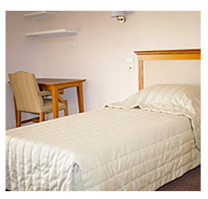
Single Private Ensuite - Main Villa Room Cost