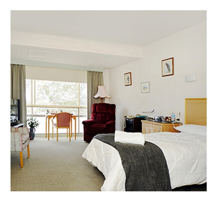
Single Room - Private 2 Room Cost $395,000