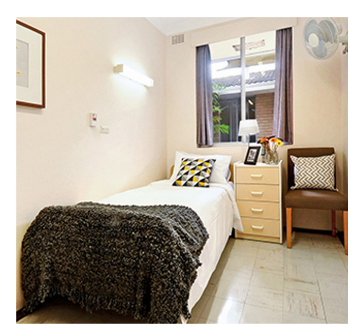
Single Room Room Cost