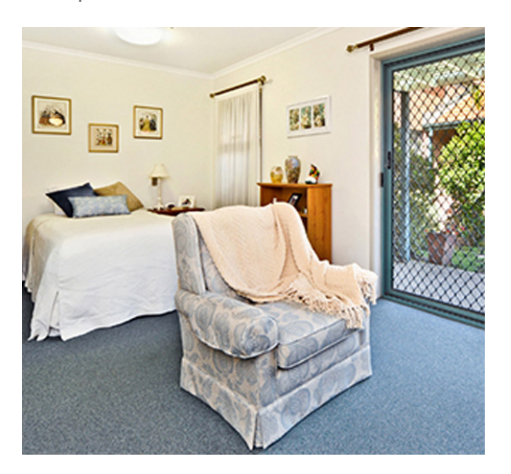
Single Room - Large Room Cost $590,000