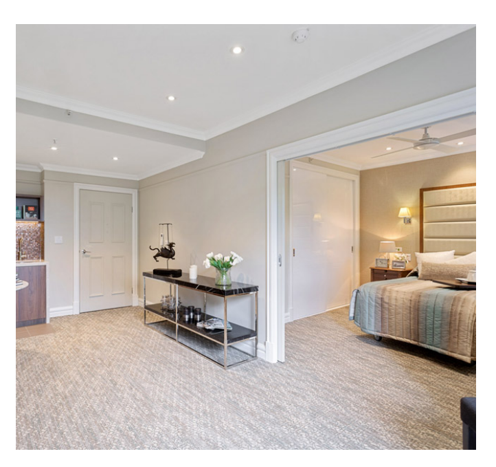
Apartment Room Cost