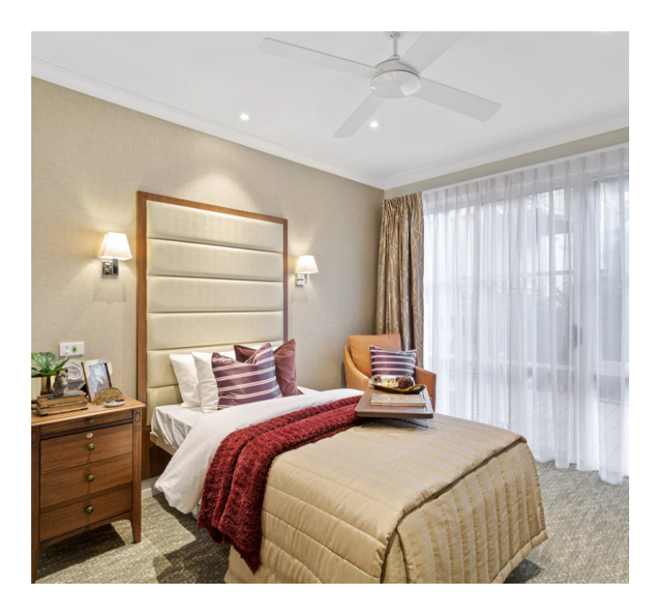
Large Single - Balcony Room Cost $710,000