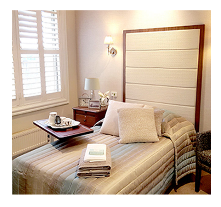
Medium Single Room Cost