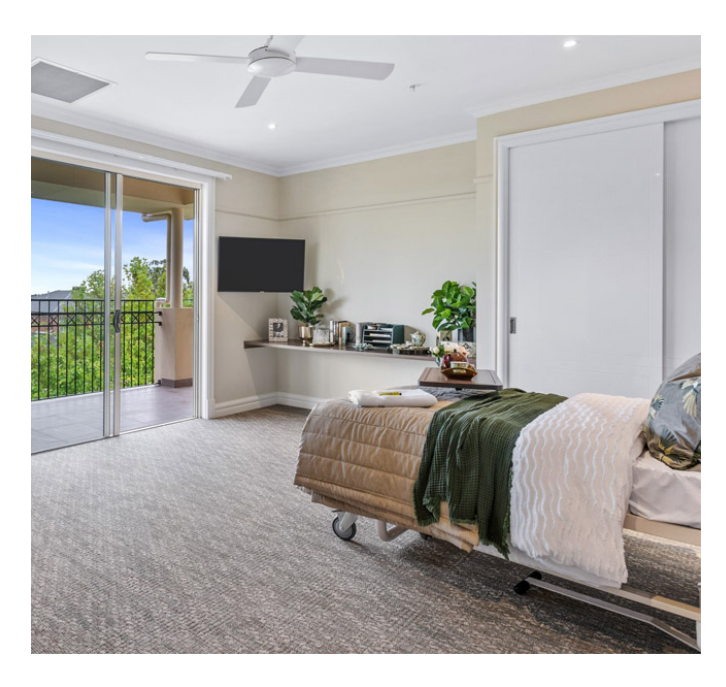
Large Single Views Room Cost $1,035,000