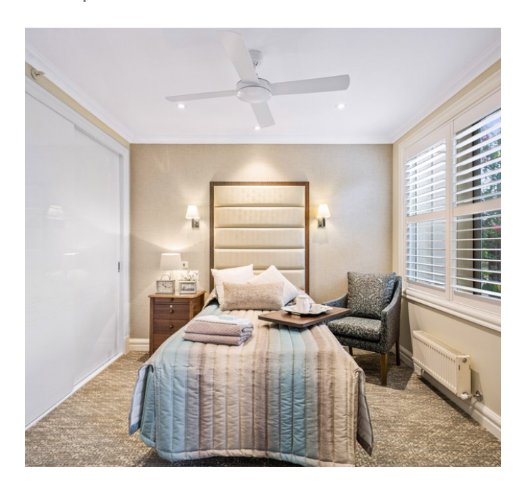
Single Room - Private Room Cost $550,000