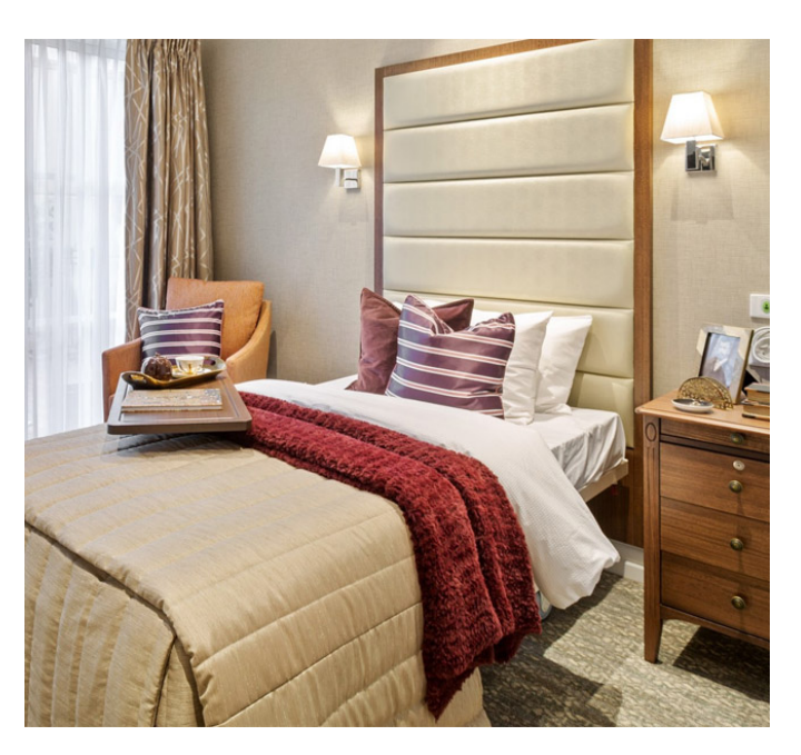
Extra Large Single Room Cost $750,000