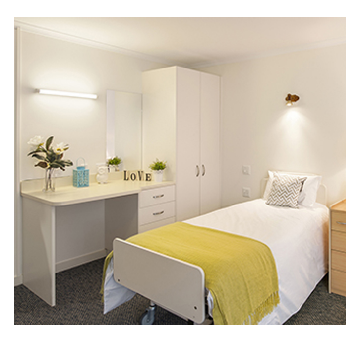
Large Single Room Cost