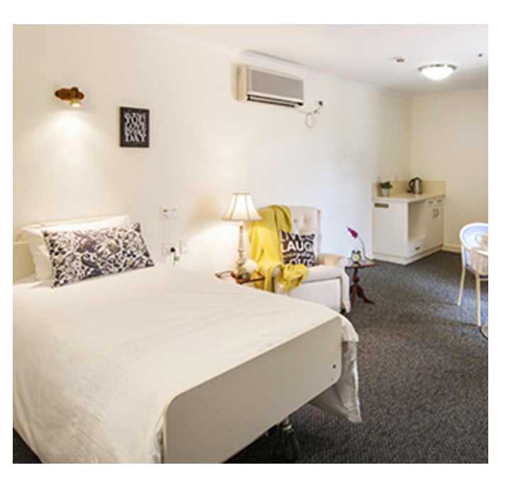
Extra Large Single Room Cost $835,000