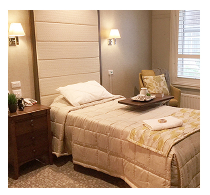
Single Private Room Cost $610,000