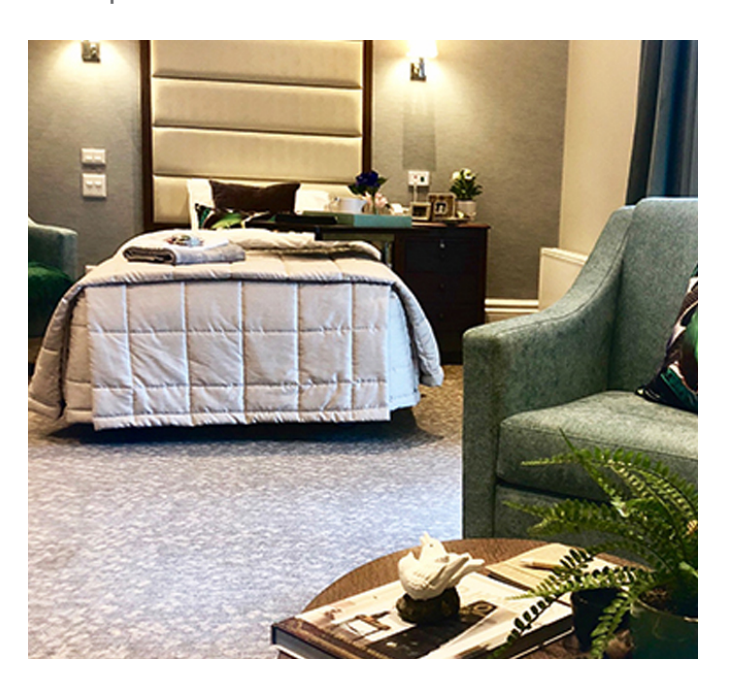
Large Single Room Cost