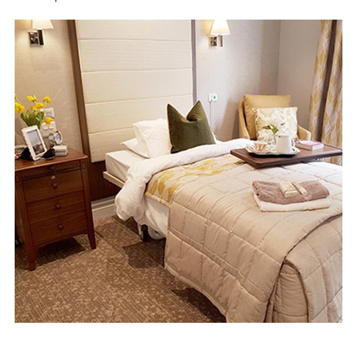
Medium Single Room Cost