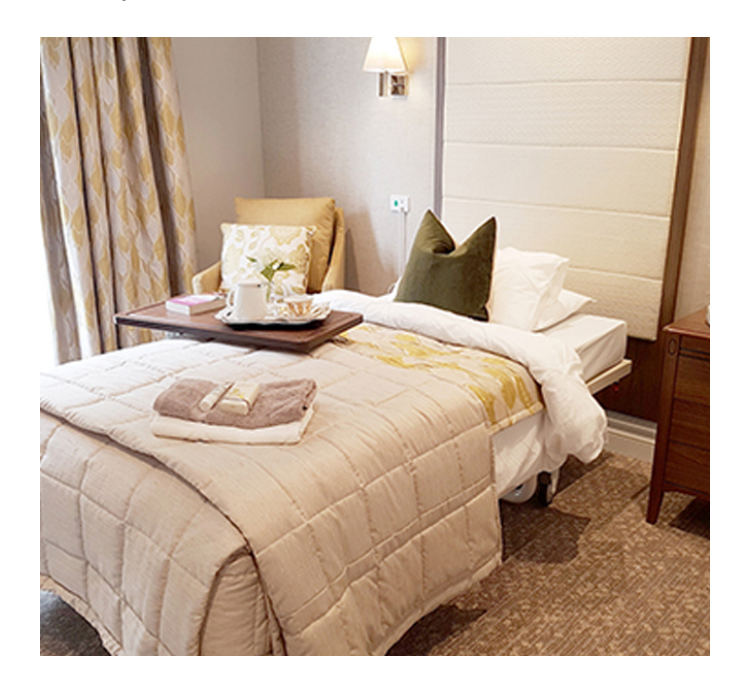
Medium Single Terrace Room Cost $855,000