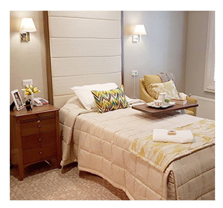
Extra Large Single Room Cost $1,010,000