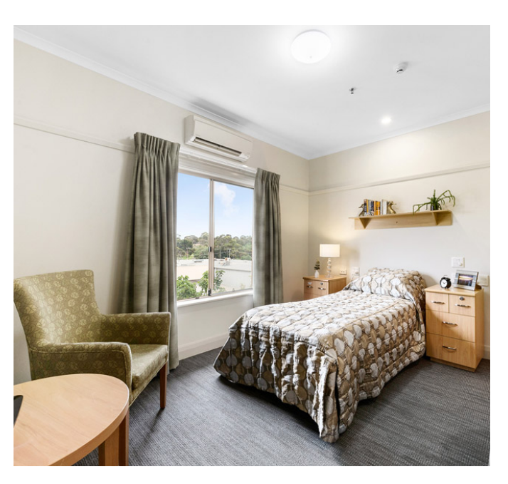
New Single - Private Room Cost $415,000