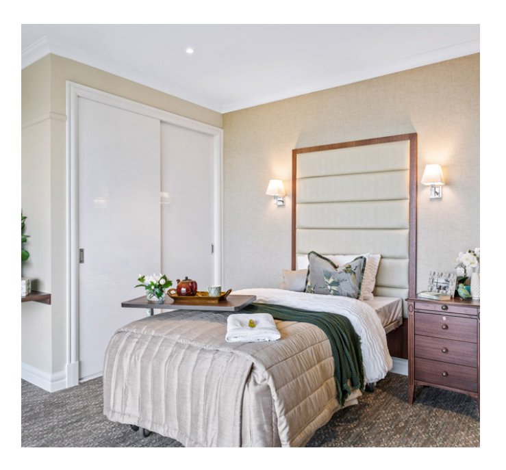
Large Single Room Cost