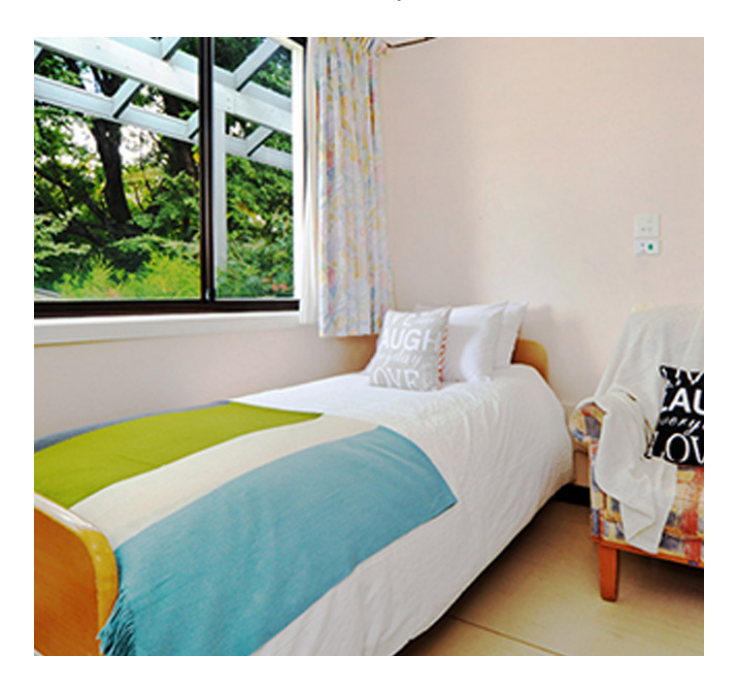
Single Room Room Cost