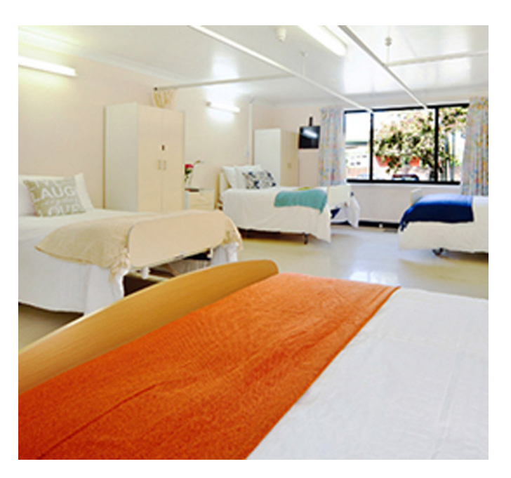
Companion Room - 4 bed Room Cost $285,000